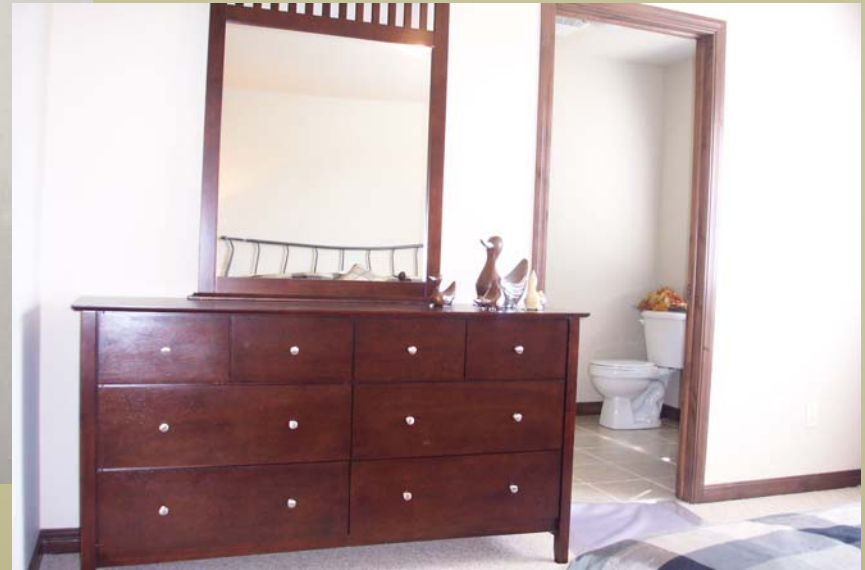
Upper level bathrooms Ensuite off master