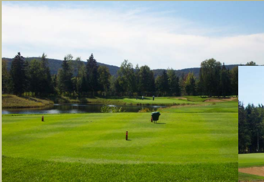
Le Diable golf course