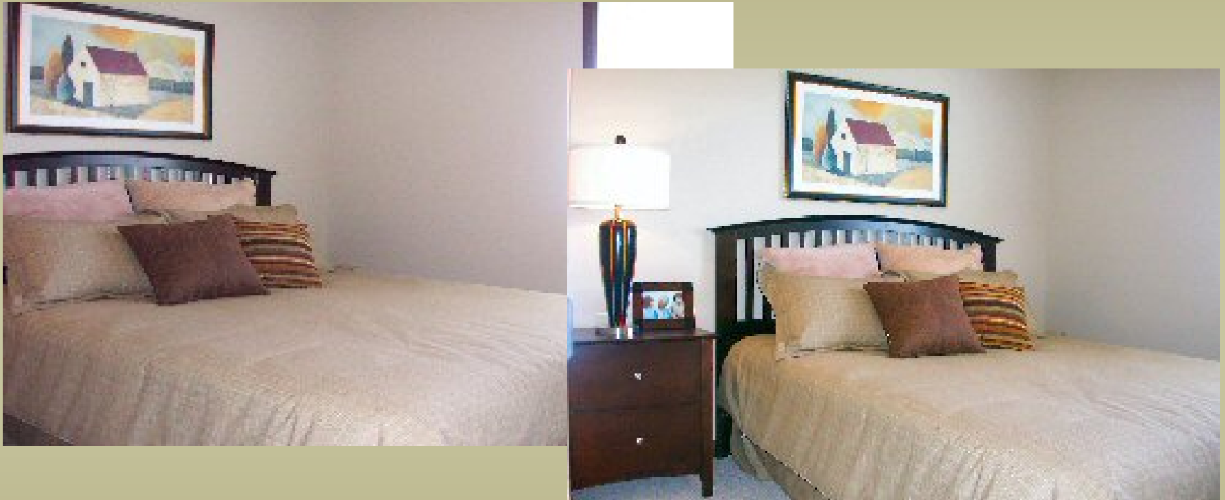
Queen size Second bedroom