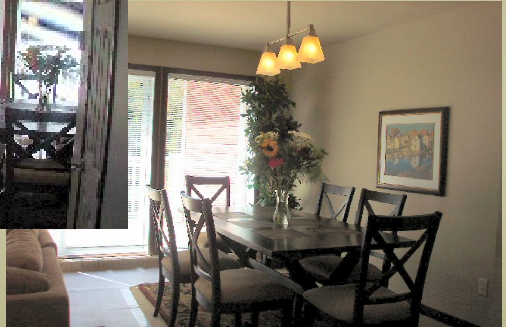
Luxurious living & dining room