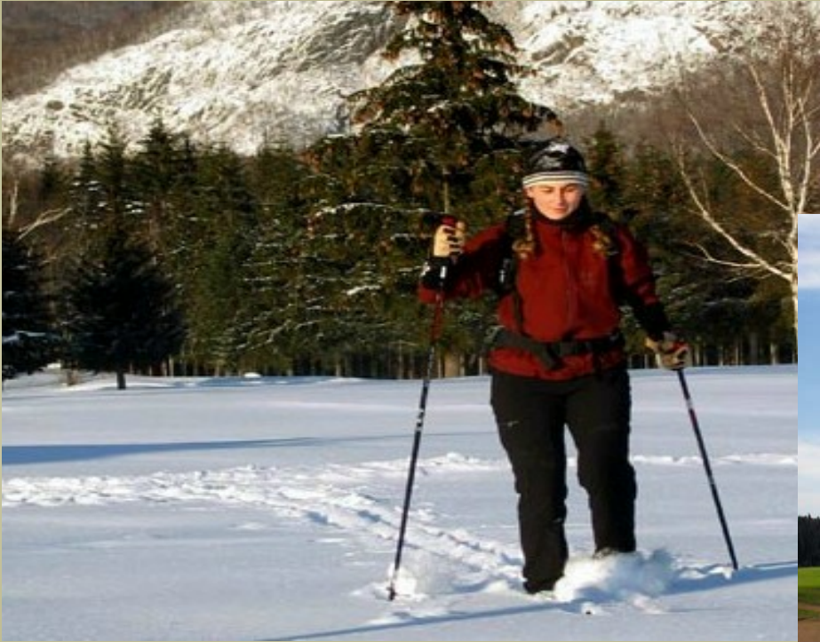
Overlooking Golf Course