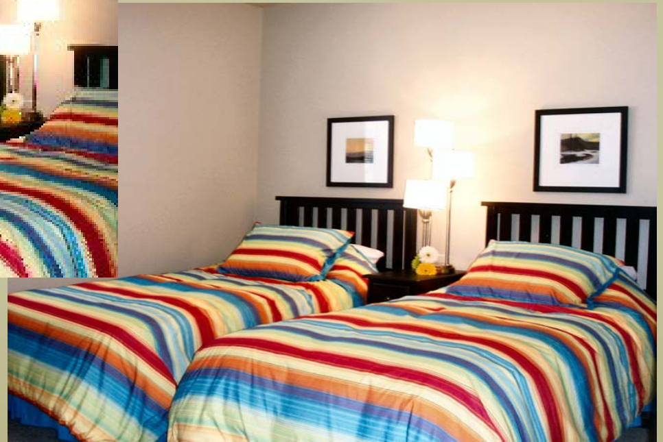
Twins beds Third bedroom