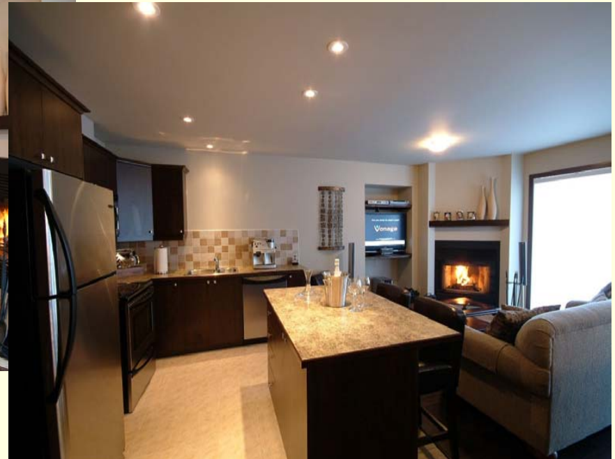
Luxurious living & dining room