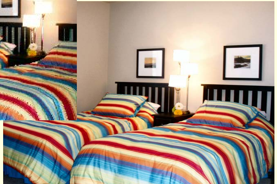
Twins beds Third bedroom