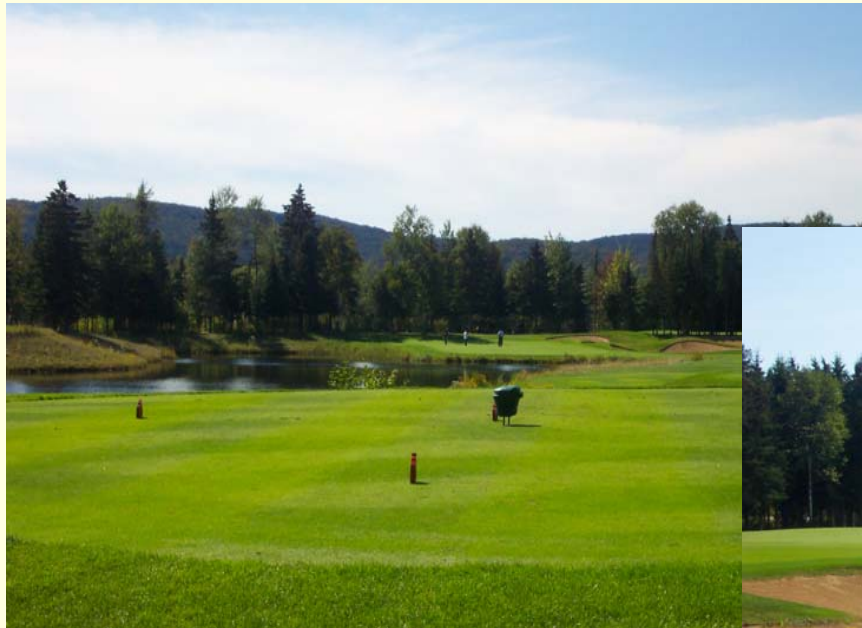
Le Diable golf course