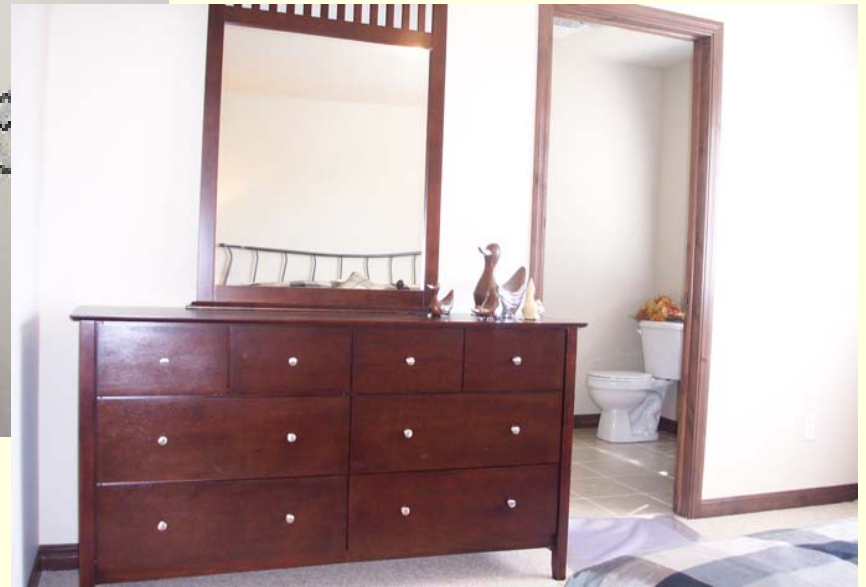
Upper level bathrooms Ensuite off master