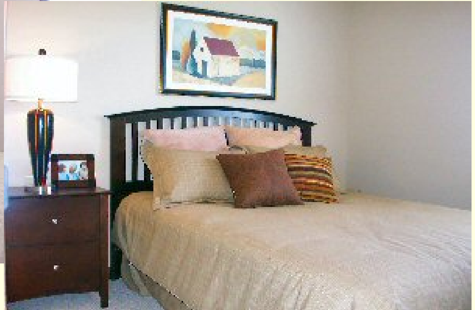
Queen size Second bedroom